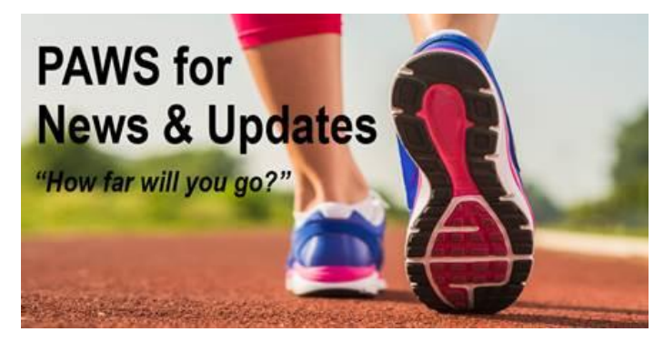
Click here to like us on Facebook!

Couch to 5K – Get off the couch and put on your running shoes! Save the date for the Couch to 5K program, starting Monday, March 5<sup>th</sup>. Click <u>here</u> for more information. To stay up to date with all things PAWS, please click <u>here</u> to join the mailing list.