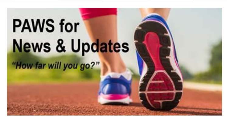
Click here to like us on Facebook!

Wednesday, February 21st, 12:00 p.m. - 1:00 p.m., GL - 482 | MMC